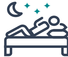
Private hospital accommodation