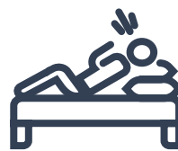
Public hospital costs