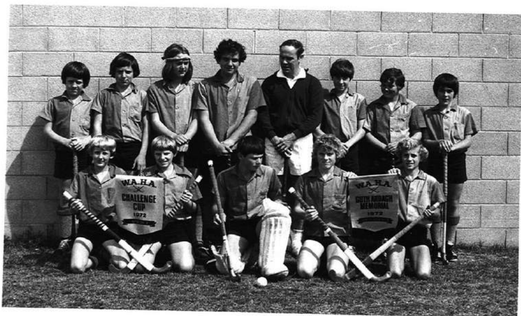
APPLECROSS Y.M.C.A. U14 Div 2 TEAM 1972

1972 has seen the club regain A status and with good coaching, support and strength evident right down through the teams, 1973 will be a year of consolidation of progress achieved and of pushing on to further success.