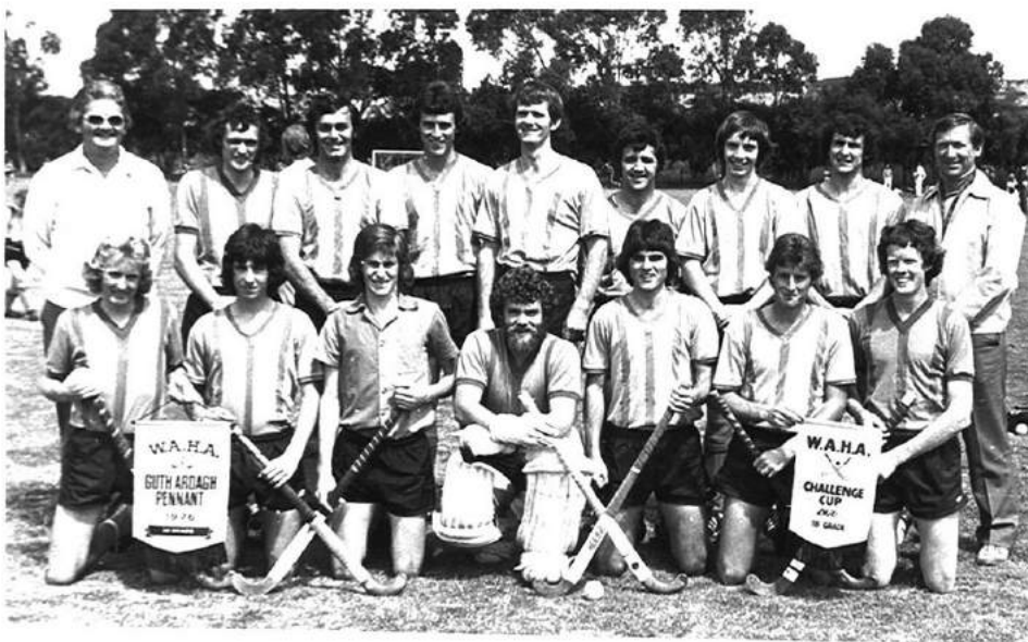
HERE THEY ARE!!!